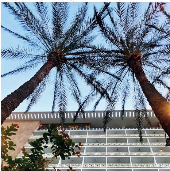
Marie-Noelle Fattal "Palm Trees 40"