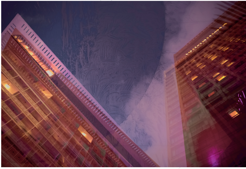
Hoby Ratsimbazafy "Day At Night" August 2018 - Room 420