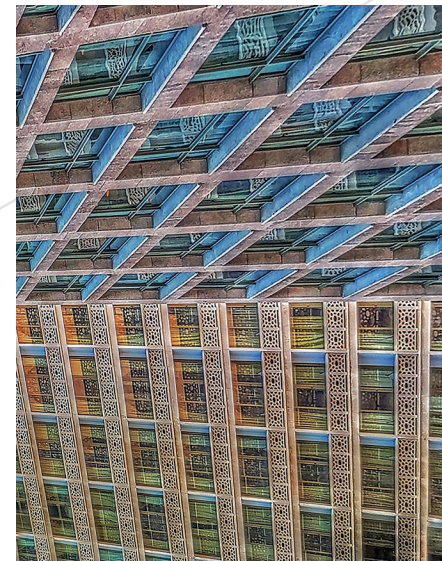
Fadi Farhat "Lost Edges"