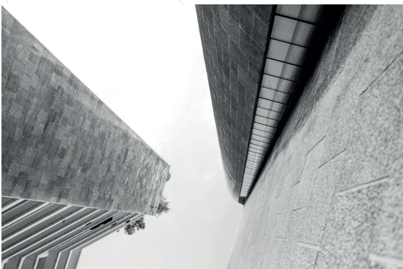
Blanche Eid "Take a Deep Breath" December 2018 - Room 520