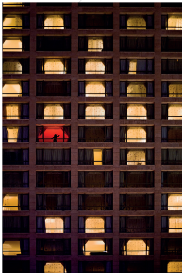
Lara Karam "Case 924"