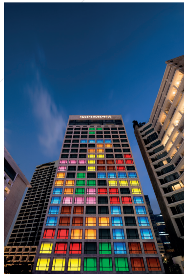
Roudy Doumit "Tétromino P" October 2018 - Room 516